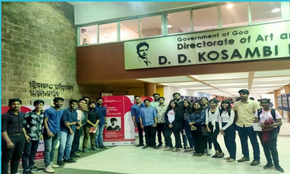
Visit to Kala Academy as a part of D. D. Kosambi Festival of Ideas.