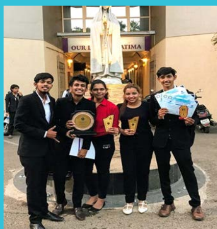
Runners up at "Cosmocrat 2019", A State Level Management Event organized by Don Bosco College, Panjim.