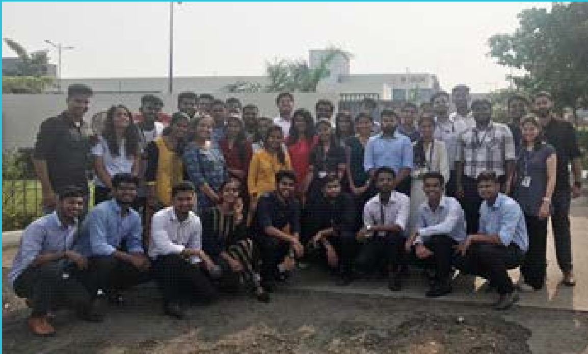
Bosch Packaging Technology, Verna Industrial Estate.