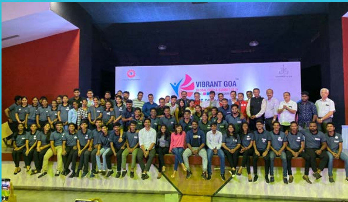
BBA student's volunteering for Vibrant Goa (Global Expo and Summit) at Dr Shyama Prasad Mukherjee Stadium.