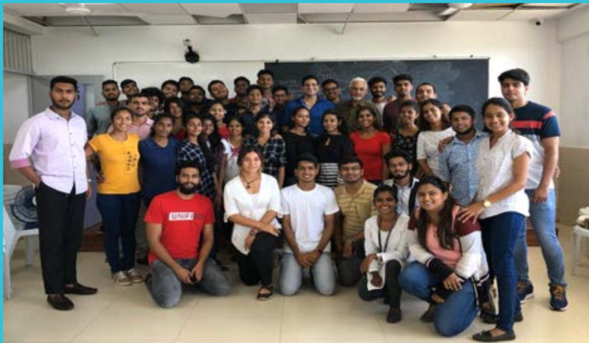
Learning Etiquette through Dance, as a part of the course "Etiquette".