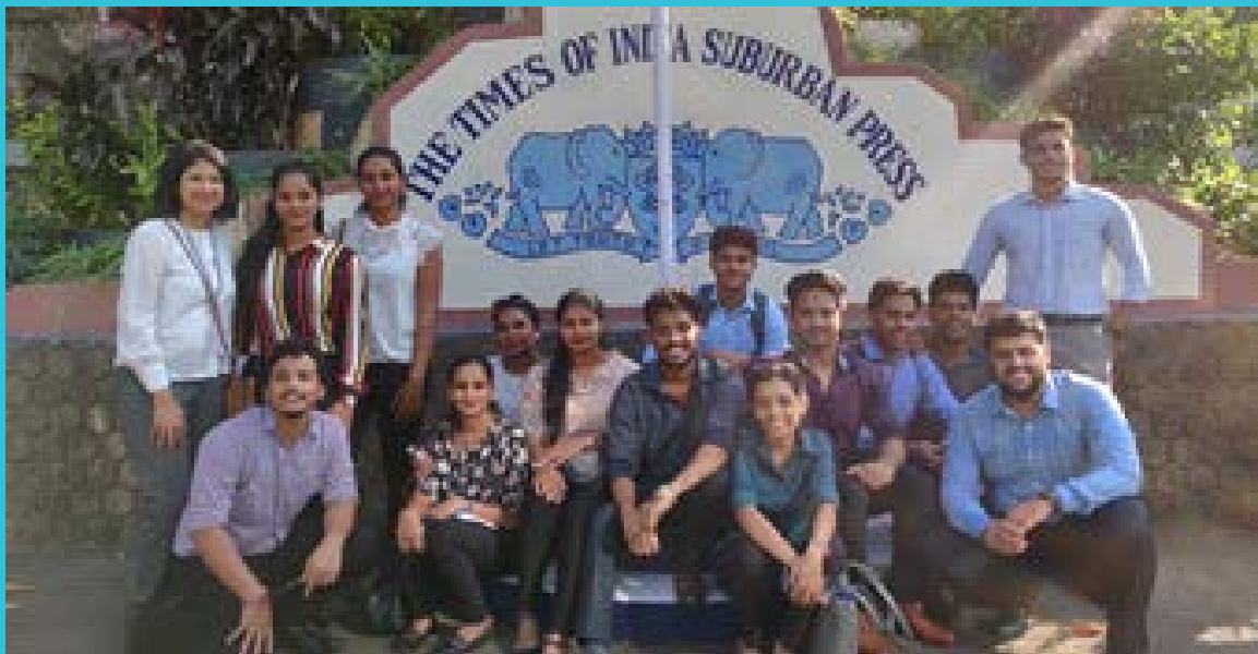
The Times of India (TOI), Kandivali - Mumbai.