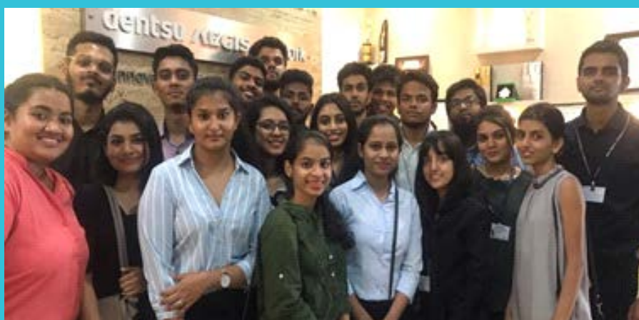
Perfect Relations Pvt Ltd, PR Agency, Worli – Mumbai.