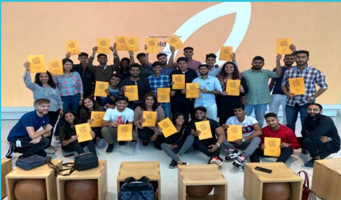
Visit to Apple Store, Dubai.