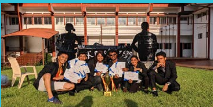
Runners Up of "X'plorateur 2019", a Management Event organized by St Xaviers College, Mapusa.