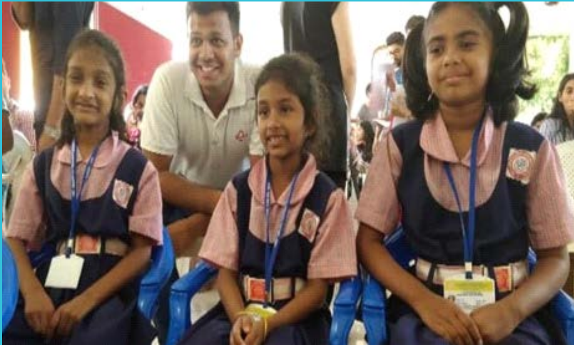
Visit to Anagha Wachasundar Pratishtan, Porvorim. Visit for the Social Issue as a part of the course "Individual and Society".