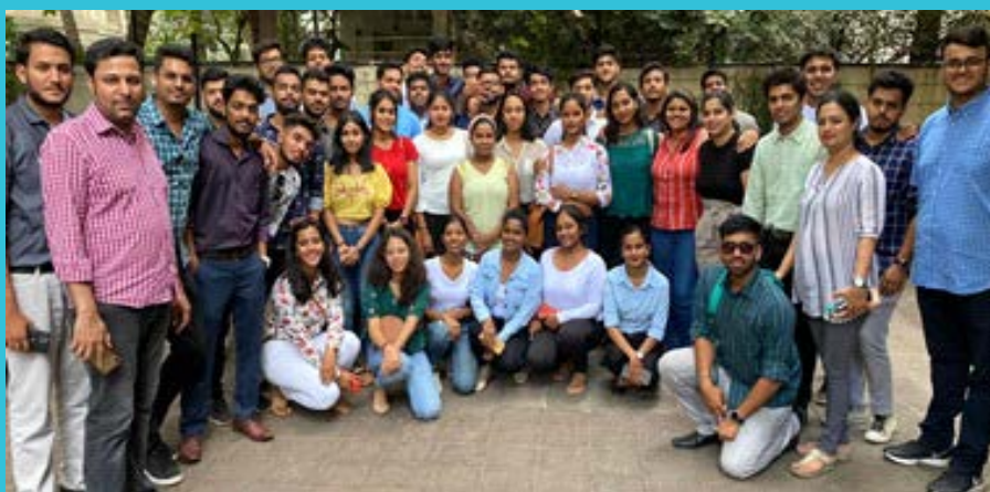
Visit to Famous Studio, Worli – Mumbai.