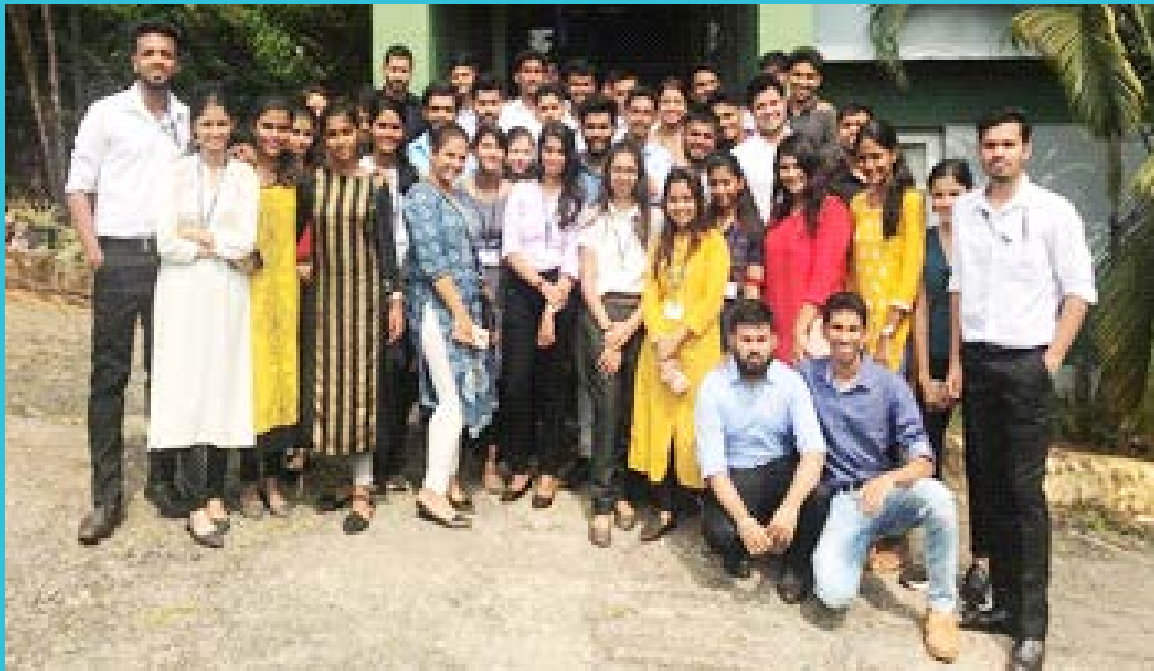
3-D Infinity Printing Company, Verna Industrial Estate.