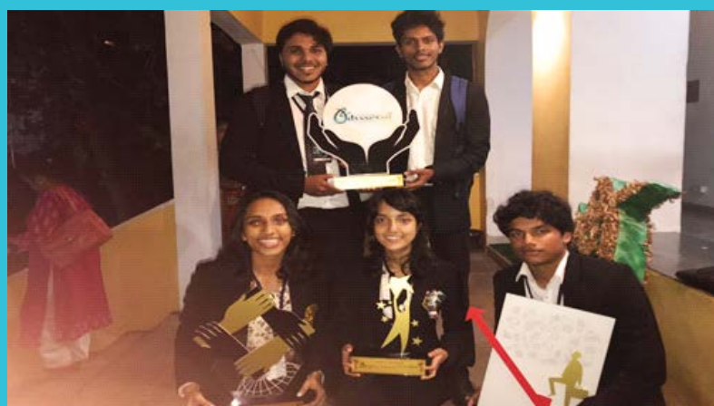
Runners up of "Odessey 2019" A National Level Management Event Organized by Saraswat College, Mapusa.