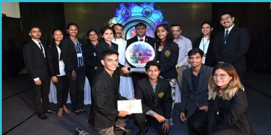
Runners up of "Impressions 2019" A National Level Management Event Organized by Rosary College, Navelim.

GUEST SPEAKERS INVITED FOR INTERACTION WITH THE BBA STUDENTS.