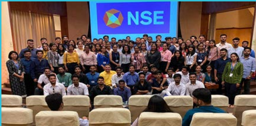
National Stock Exchange (NSE), Bandra Kurla Complex – Mumbai.