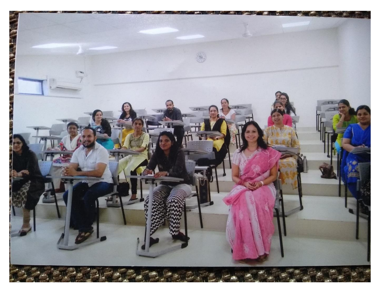
Teachers from 15 Commerce Colleges participated in the deliberation and there were 17 participants from all over Goa.