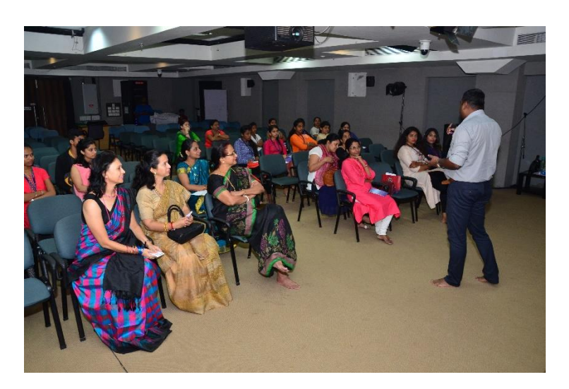
46 participants from 12 Colleges attended the Seminar which included Students as well as teachers.